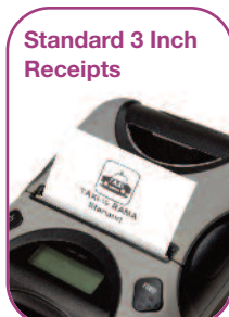
Standard 3 Inch Receipts