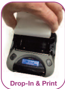
Drop-In & Print