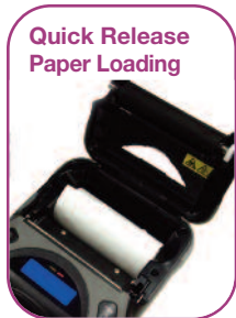
Quick Release Paper Loading